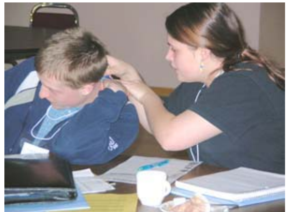
Checking the label – "you are what you wear"

From this body of work came the impetus to produce "Creating Climate-Friendly Communities: A