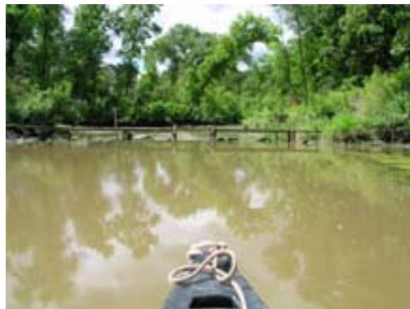
Mapping the Seine River

use of the Manigotagan River and to raise awareness of its history and ecosystems. In collaboration with interested partners, the Manitoba Eco-Network’s GIS Centre will establish two maps. One waterproof paper map for orientation while paddling and one web-based, interactive map that will provide additional information, educate about the river, increase awareness of its natural environments and history.