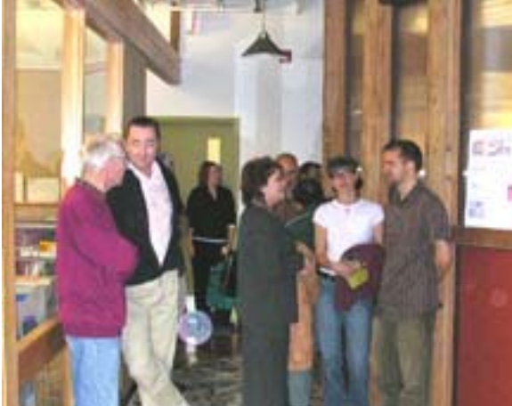
Donors and volunteers celebrate the new EcoCentre

contributions from funders and volunteers who helped to make the project happen. We have hosted many informal tours to demonstrate the use of green and reused building materials in our new space. CTV ran a short promotional feature about the project as part of its series on projects supported by the Winnipeg Foundation. This feature won an Honourable Mention at the Annual Television Broadcasters awards, and was seen by many Winnipeg viewers.