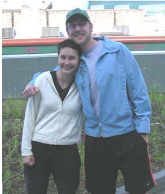
2006 Organic Lawn Care Educators