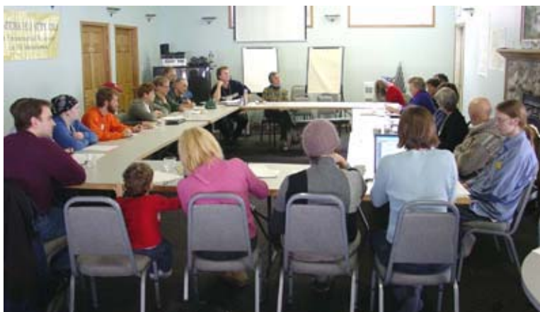
Forum participants at Onanole

Member Forum - This year we took our annual member group forum out to rural Manitoba, with the goal of increasing our outreach to environmental activists and groups outside Winnipeg. The event was a great success, with participants attending from Thompson, Flin Flon, Swan River and The Pas, as well as many from western Manitoba. The event was held in Onanole, just south of Riding Mountain National Park, and included presentations on current issues, capacity building workshops, informal networking, and a meeting with the Minister of Conservation. The event was held in conjunction with a water caucus meeting.